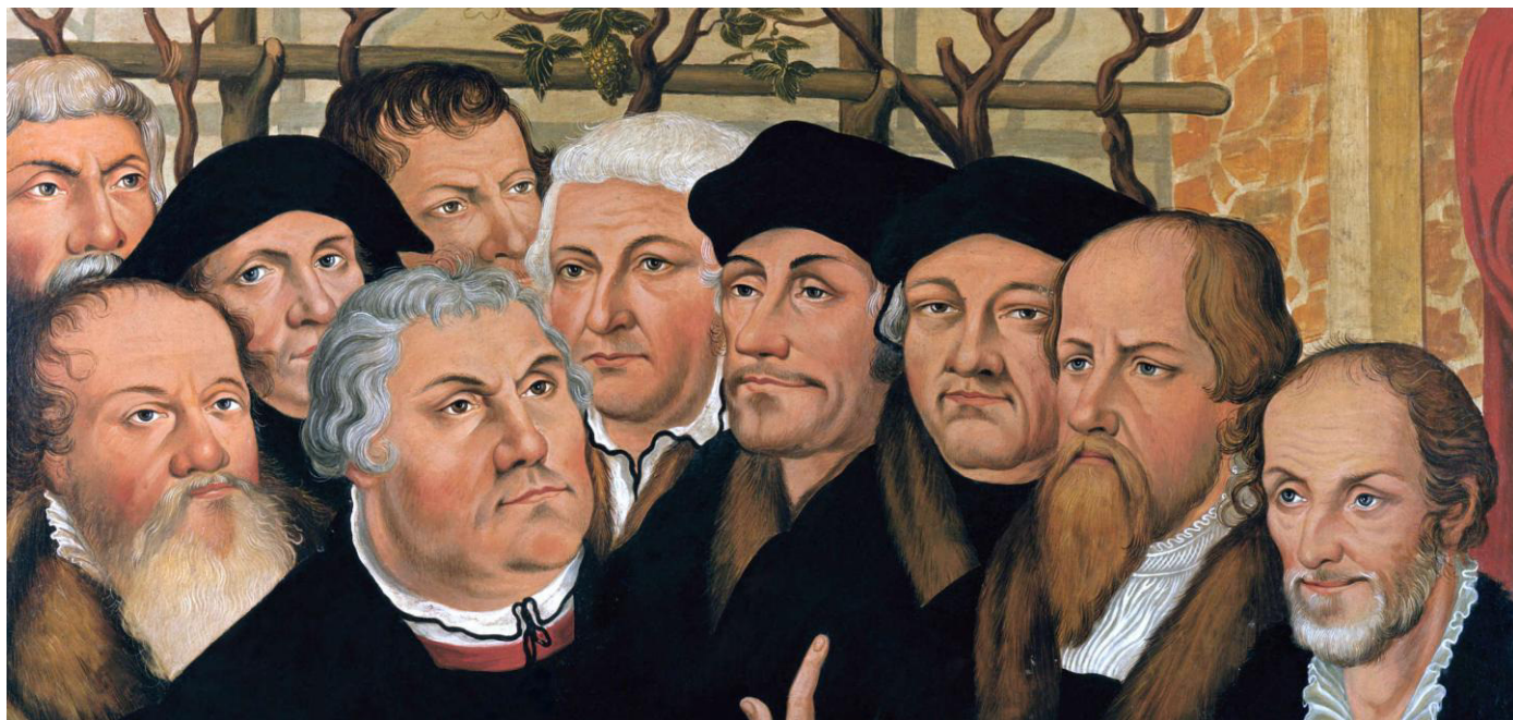
Reformers from left: Johannes Forster, Georg Spalatin, Martin Luther, Johannes Bugenhagen, Erasmus of Rotterdam, Justus Jonas, Caspar Cruciger and Philipp Melancthon. That's a copy after the Meienburg epitaph by Lucas Cranach the Younger (1515-1586).

The cause of truth was destined to triumph. God's faithful builders were not toiling alone. Could their eyes have been opened, they would have seen as marked evidence of divine presence and aid as was granted to a prophet of old. When Elisha's servant pointed his master to the hostile army surrounding them and cutting off all chance of escape, the prophet prayed, "Lord, I pray thee, open his eyes, that he may see." And, lo, the mountain was filled with chariots and horses of fire, the army of Heaven stationed to protect the servant of the Lord. Thus did the angels of God guard the workers in the cause of the Reformation. God had commanded his servants to build, and the combined forces of earth and hell were powerless to drive them from the walls. Saith the Lord, "I have set watchmen upon thy walls, O Jerusalem, which shall never hold their peace day nor night."