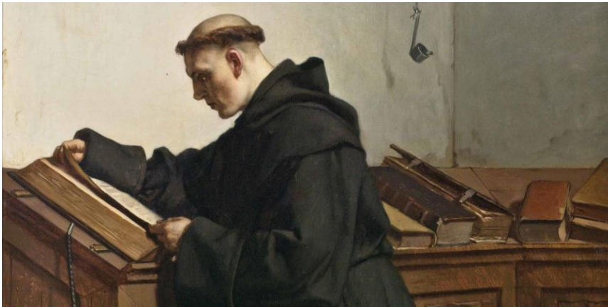
Luther discovers the Bible.

"The fear of the Lord is the beginning of wisdom." That fear dwelt in the heart of Luther, enabling him to maintain his steadfastness of purpose, and leading him to deep humility before God. He had an abiding sense of his dependence upon divine aid, and he did not fail to begin each day with prayer, while his heart was continually breathing a petition for guidance and support. "To pray well," he often said, "is the better half of study."