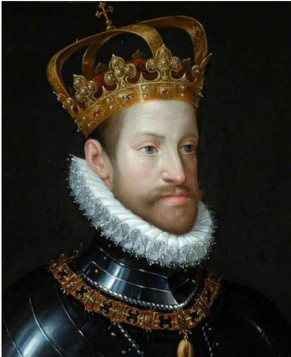
The emperor Charles V (1500-1558).

leading us all the way in the past, and that the path where he leads will be safe for all who follow him, even in the stormy days of trial and conflict." The first assembly of the German States after the accession of Charles the Fifth to the empire, gathered at Worms on the 6th of January, 1521. Never before had so many princes attended this national council. All were eager to take a part in the first acts of the young emperor's government, and all were ambitious to display their power and grandeur. There were important political questions and interests to be considered by this grand assembly, but all these appeared of little moment when contrasted with the cause of the monk of Wittenberg.