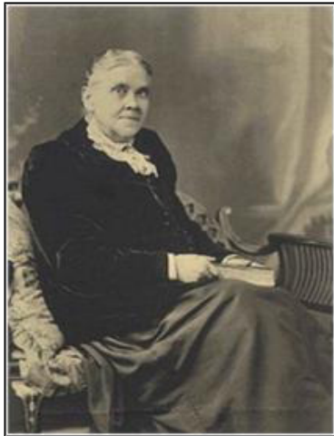
The author: Ellen G. White (1827-1915).

Through all the ages of papal darkness and oppression, God's care was over his cause and his people. Amid opposition, conflict, and persecution, an all-wise providence was still at work in the upbuilding of Christ's kingdom. Satan exercised his power to hinder the work of God, by destroying the workmen; but as soon as one laborer was imprisoned, or slain, another was raised up to fill the vacancy. Despite all the opposing powers of evil, angels of God were doing their work, heavenly messengers were searching out men to stand as light-bearers amid the darkness. Notwithstanding the wide-spread apostasy, there were honest souls who had given heed to all the light which shone upon them. In their ignorance of God's word they had received the doctrines and traditions of men, but when the word was placed within their reach, they earnestly studied its pages, and in humility of heart they wept and prayed for a knowledge of God's will. With great joy they accepted the light of truth, and eagerly sought to impart light to their fellow-men.