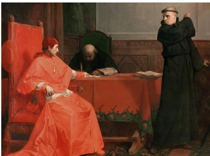
The pope's legate cardinal Cajetan during the controversy with Luther.

Luther soon received his safe-conduct, and prepared to appear before the legate. On receiving information of the fact, this dignitary was somewhat perplexed to decide what course to pursue with a man of so determined character, and he consulted his friends in regard to the matter. One was decided in the opinion that he should be made to retract; another, that he be arrested and imprisoned. A third boldly advised that he be put out of the way, while a fourth recommended that an attempt be made to win him over by gentleness. It was decided to adopt the last advice as the safest.