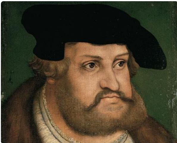
The elector Frederic the Wise of Saxony (1463-1525). He was the royal protector of Luther.

"Since Brother Martin cannot be brought by parental measures to acknowledge his errors, and continue faithful to the Catholic Church, I request your highness to send him to Rome, or to banish him from your territories. Be assured that this complicated, evil-intentioned affair cannot be long protracted, for as soon as I shall have informed our most holy lord of all this artifice and malice, he will bring it to a speedy end." In a postscript he begs the elector not to tarnish with shame his own honor and that of his illustrious ancestors for the cause of a contemptible monk.