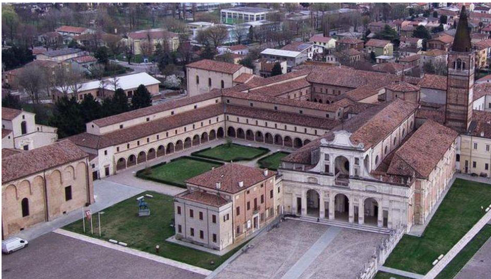
Benedictine Abbey of Polirone in San Benedetto Po (Province of Mantua).

Luther was still a true son of the papal church, and had no thought that he would ever be anything else. In the providence of God he decides to visit Rome. He pursues his journey on foot, lodging at the monasteries on the way. He passes the Alps, and descends into the plain of Italy, and is filled with wonder as he goes. Visiting a convent in Lombardy, he sees the splendor of the apartments, the richness of the dresses, the luxury of the table, the extravagance everywhere. With painful misgivings he contrasts this scene with the self-denial and hardship of his own life. His mind is becoming perplexed.